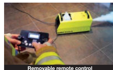
Removable remote control