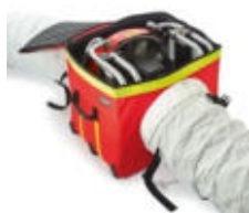
V-Box in blowing mode