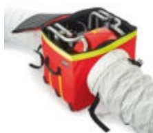
V-Box in extraction mode