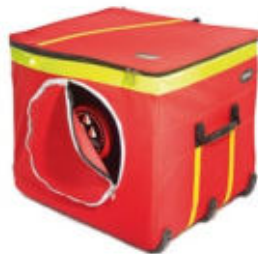
Ductless V-Box cube