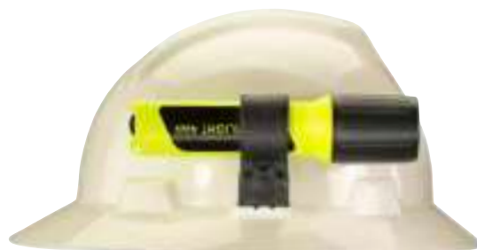
4AA ProPolymer® Lux