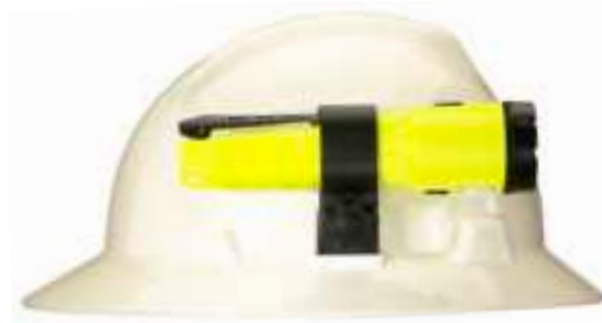
Dualie® 3AA/Dualie® 3AA Color-Rite®