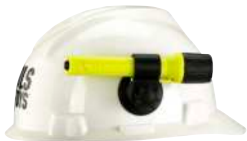
2AA ProPolymer® HAZ-LO®