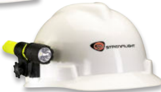
Shown with Dualie 2AA (not included) using slot attachment