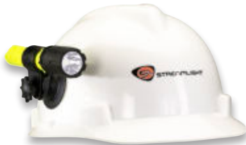
Shown with Dualie 2AA (not included) using adhesive base