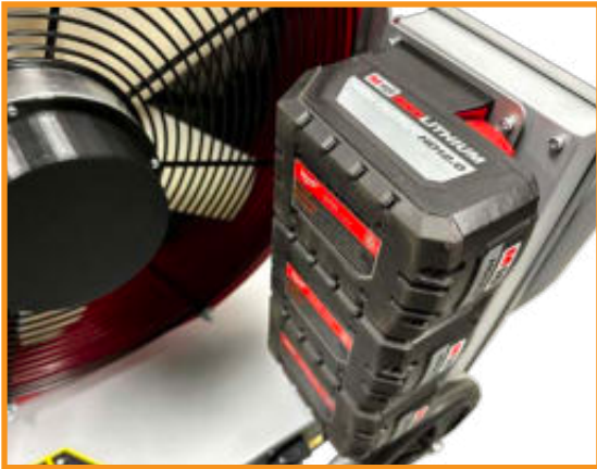
Powered by 1 and up to 3 Milwaukee® M18™ REDLITHIUM™ HIGH OUTPUT™ HD12.0 Batteries

TEMPEST TECH SERIES BATTERY POWER BLOWERS